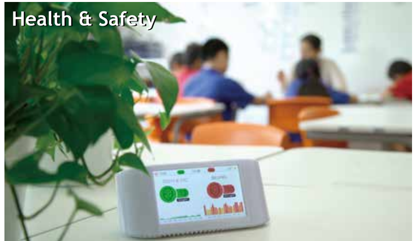
Health & Safety